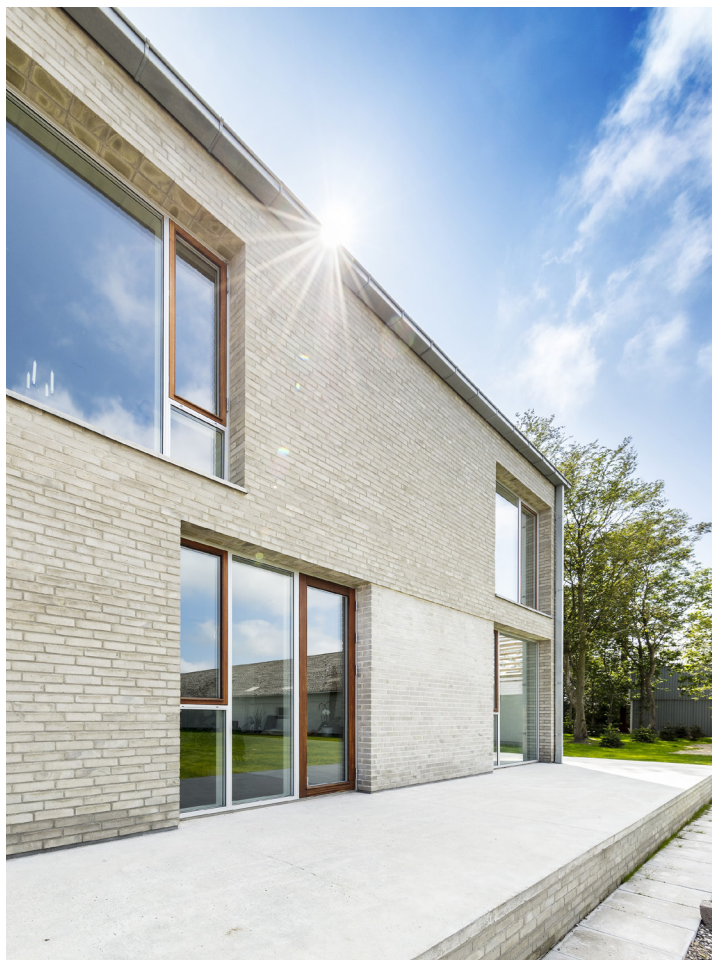
COTO 62 // WOOD/ALUMINIUM