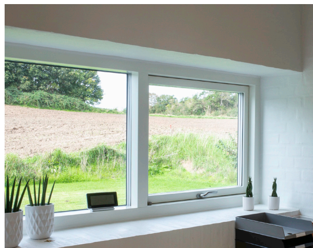
COTO 62 // WOOD/ALUMINIUM