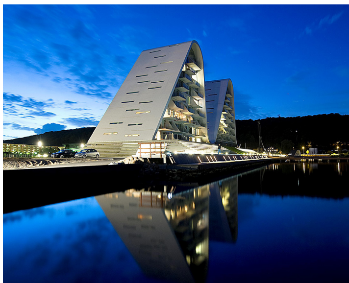
COTO 62 // WOOD/ALUMINIUM