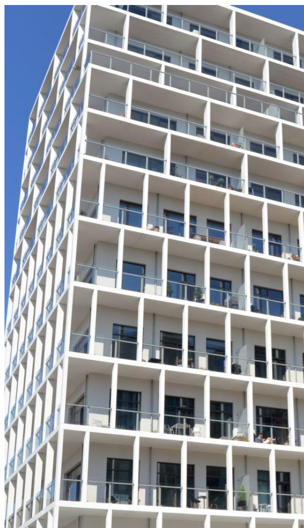
COTO 62 // WOOD/ALUMINIUM